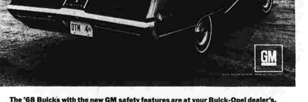
The '68 Buicks with the new GM safety features are at your Buick-Opel dealer's.

Yemen Head Dismissed ADEEN (AP) — In a purge of its armed forces, the socialist government of the new South Yemen People's Republic dismissed the army's commander, the commissioner of police and five tribal princes Thursday.